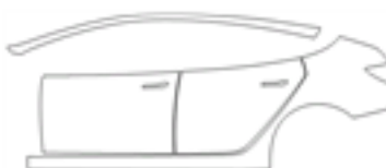
P8203H - Rear Fender and Door Kit