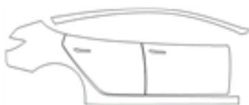
P8203G - Rear Fender and Door Kit