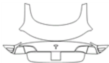
P8203E - Trunk Lid Kit