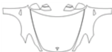
P8203C - Full Hood, Fender and Mirror Kit